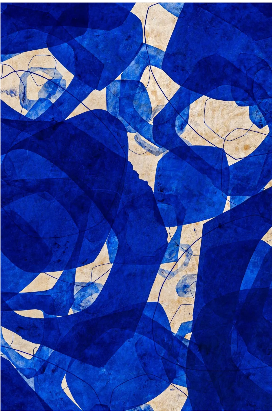
Fernando Varela / Press materials