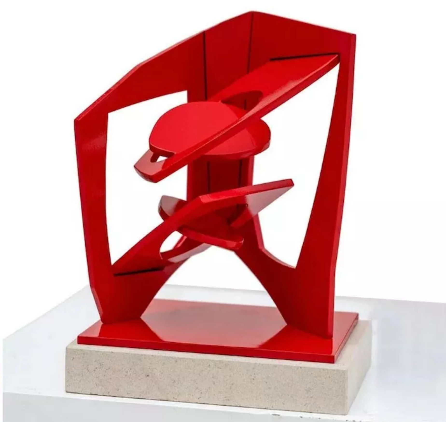
Fernando Varela

boundary for him, the meeting point of matter with the intangible," as we learn from the press release.